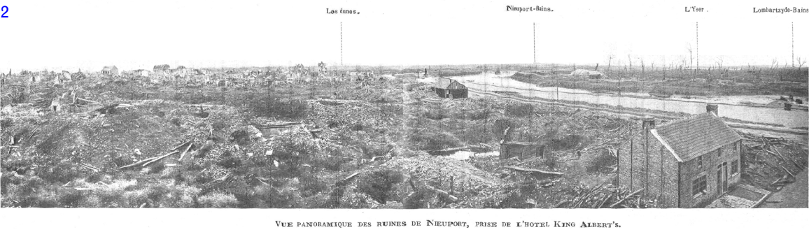
VUE PANORAMIQUE DES RUINES DE NIEUPORT, PRISE DE L'HOTEL KING ALBERT'S.