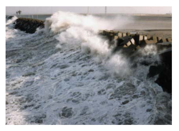
Fig. 2. Overtopping event at Zeebrugge (Belgium).