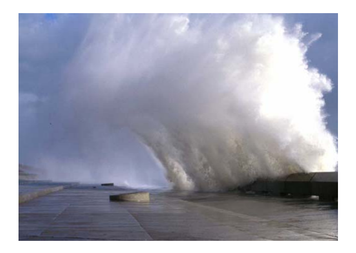
Fig. 1. Overtopping event at Samphire Hoe (U.K.).

The project will use two main approaches. Firstly, wave overtopping will be measured at three coastal sites in Europe (Zeebrugge, Belgium (Fig. 2); Ostia, Italy and Samphire Hoe, UK (Fig. 1)). Storms measured on these sites will be reproduced in small scale laboratory tests and by numerical modelling. Results will be compared and a firm conclusion on scale effects and how to deal with it will be drawn. Additional, effects of long waves on overtopping will be investigated by prototype measurements at Petten, the Netherlands. The second approach is to gather all existing data on wave overtopping in a homogeneous data base, to supplement that data base with the new full scale measurements and more small scale testing. and to develop a generally applicable design method. This new method includes the development of a neural network and will include conclusions on scale effects.