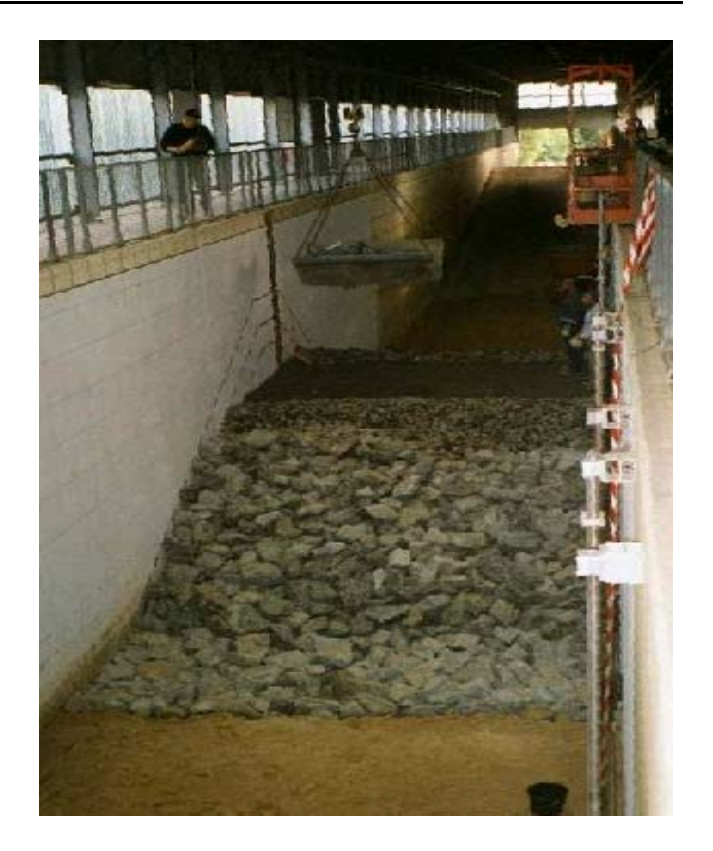
Fig. 1. Construction of the rubble mound breakwater in the wave flume.

Laboratory wave run-up results differ from field or large scale measurement results, especially for 'very rough' (rubble mound breakwaters armoured with artificial armour units) slopes. These differences are due to scale effects and modelling effects. This project allows to verify wave run-up on a slope with an 'intermediate roughness' by providing large scale data to compare with small scale model test results.