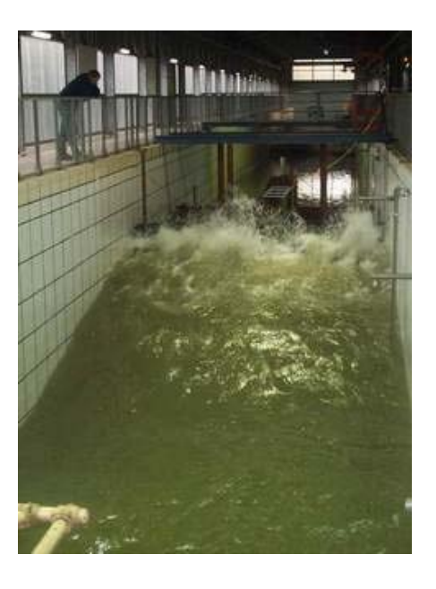
Fig. 4. Testing of the breakwater using an irregular wave train (JONSWAP spectrum) in the GWK.