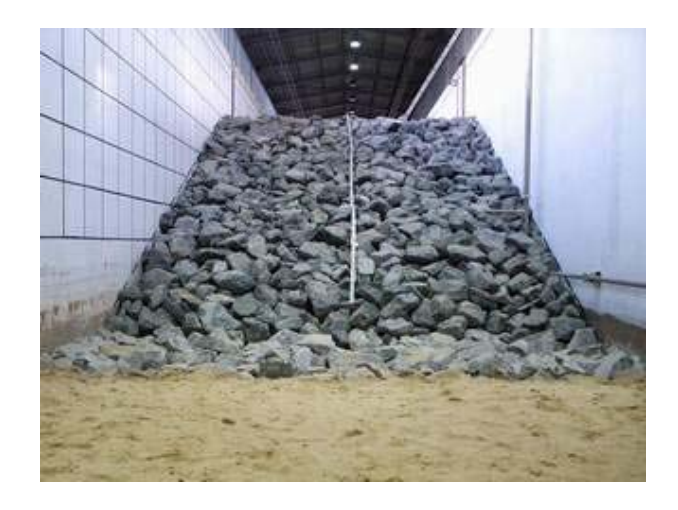
Fig. 3. The run-up gauge (designed and constructed at Ghent University) mounted on the seaward (1:2) slope of the breakwater.

<u>bjorn.vandewalle@UGent.be</u>, or visit the home page of the department at <u>http://awww.UGent.be</u>.