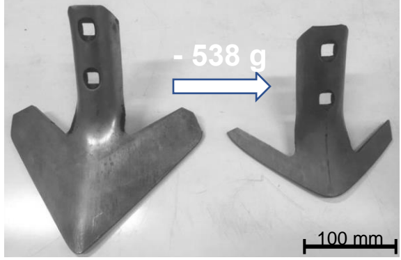
Figure 1 Wear of agricultural tine after 145 km operation in sandy loam

The agricultural sector faces a huge challenge to achieve sustainable development besides tackling the effects of global warming. Wear of agricultural parts may play an important role in the future where the productivity of the food has to meet the growing population. Besides the productivity, the cost involved in the wear of agricultural tools is also significantly high. Downtime due to the replacement of worn agricultural machine parts affects the production and influences the lead time in the season of seeding and planting crops.