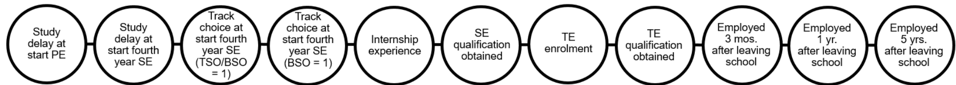
Figure 2. Schematic overview econometric model.

Note. The following abbreviations are used: PE (primary education), SE (secondary education), TE (tertiary education), mos. (months), yr. (year), and yrs. (years).