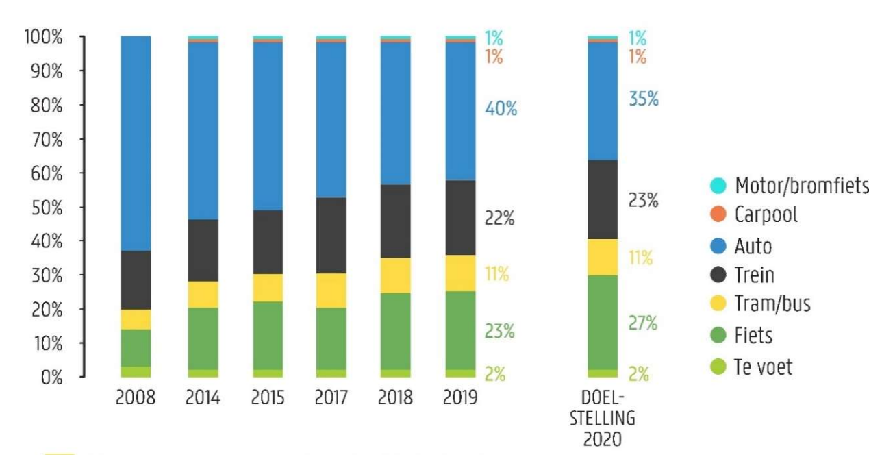
Fig. 1: Transport choices of employees for their main commuting route from 2008 (start of census) to 2019. The 2020 target is also shown.

The mode of transport for student journeys is monitored using surveys conducted in 2014 and 2019. The survey distinguishes between three different movements of students: (1) commuter students' movements from home to their campus, and kot students' movements (2) to their kot and (3) from there to their campus.