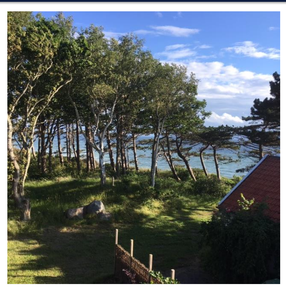
Jagerspris, Denmark, July 2017