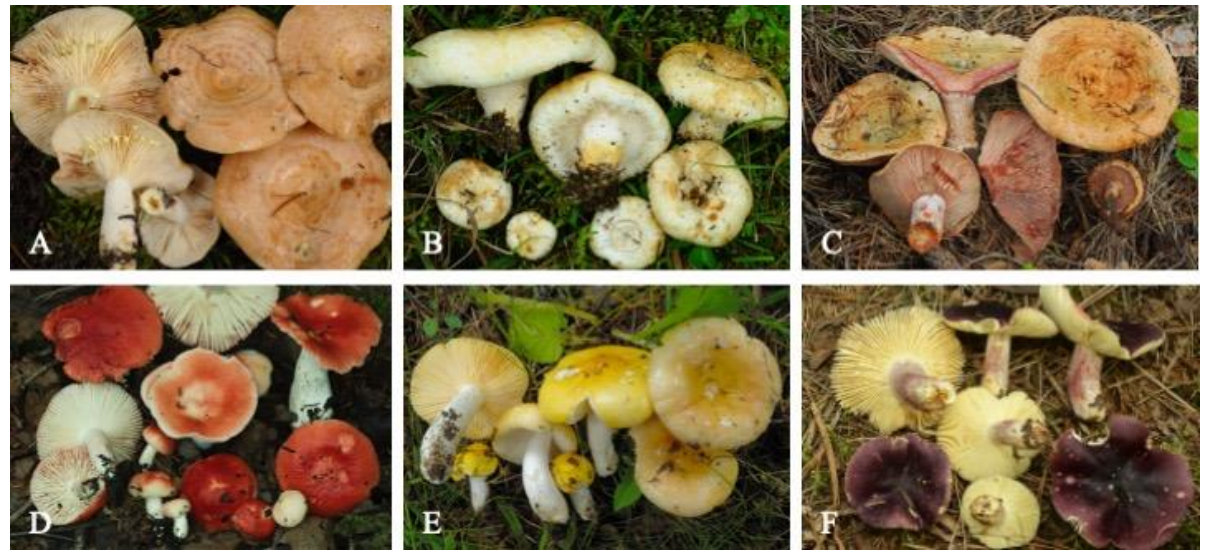
Some of the species found in Saaremaa: a) Lactarius chrysorrheus, b) Lactarius citriolens, c) Lactarius sanguifluus, d) Russula luteotacta, e) Russula risigallina, f) Russula sardonia.

We would like to announce that the next Russulales workshop will take place in Estonian island Saaremaa in a small town of Kuressaare situated on the southwest coast of this largest Estonian island. Saaremaa is covered for 40% by mixed or broadleaf forests, has a mild maritime climate and a variety of soils which offer high expectations for Russulaceae diversity. Every day two or three destinations will be offered for field collecting to get good variety of species and a silent forest experience for everybody. In Saaremaa, you can find stunted vegetation in limestone region that is covered with thin soil, heath forests, dry boreal forests and fresh boreo-nemoral forests. Typical ectomycorrhizal trees are Pinus sylvestris , Betula pendula/ pubescens , Populus tremula , Picea abies , Quercus robur , Alnus glutinosa/ incana , Coryllus avellana , Tilia cordata . Typical landscape of the island was wooded pastures dominated by Juniperus , but they have changed towards forests due to a lack of grazing management. More information about the island is available on: <a href="https://visitsaaremaa.ee/en/">https://visitsaaremaa.ee/en/</a>.